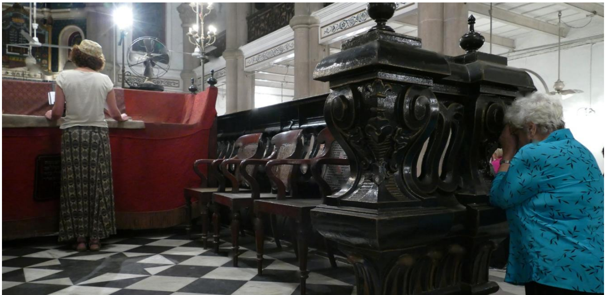
Rahel leading a service in Calcutta.

Please join us on this unforgettable adventure!